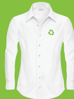
MADE FROM 12 PET BOTTLES

MANUFACTURING RANGE OF TEXTILE PRODUCTS SUCH AS SHIRT, T-SHIRT, JACKETS, ETC.